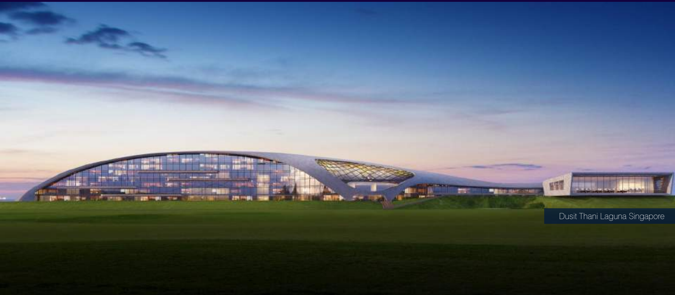
Dusit Thani Laguna Singapore