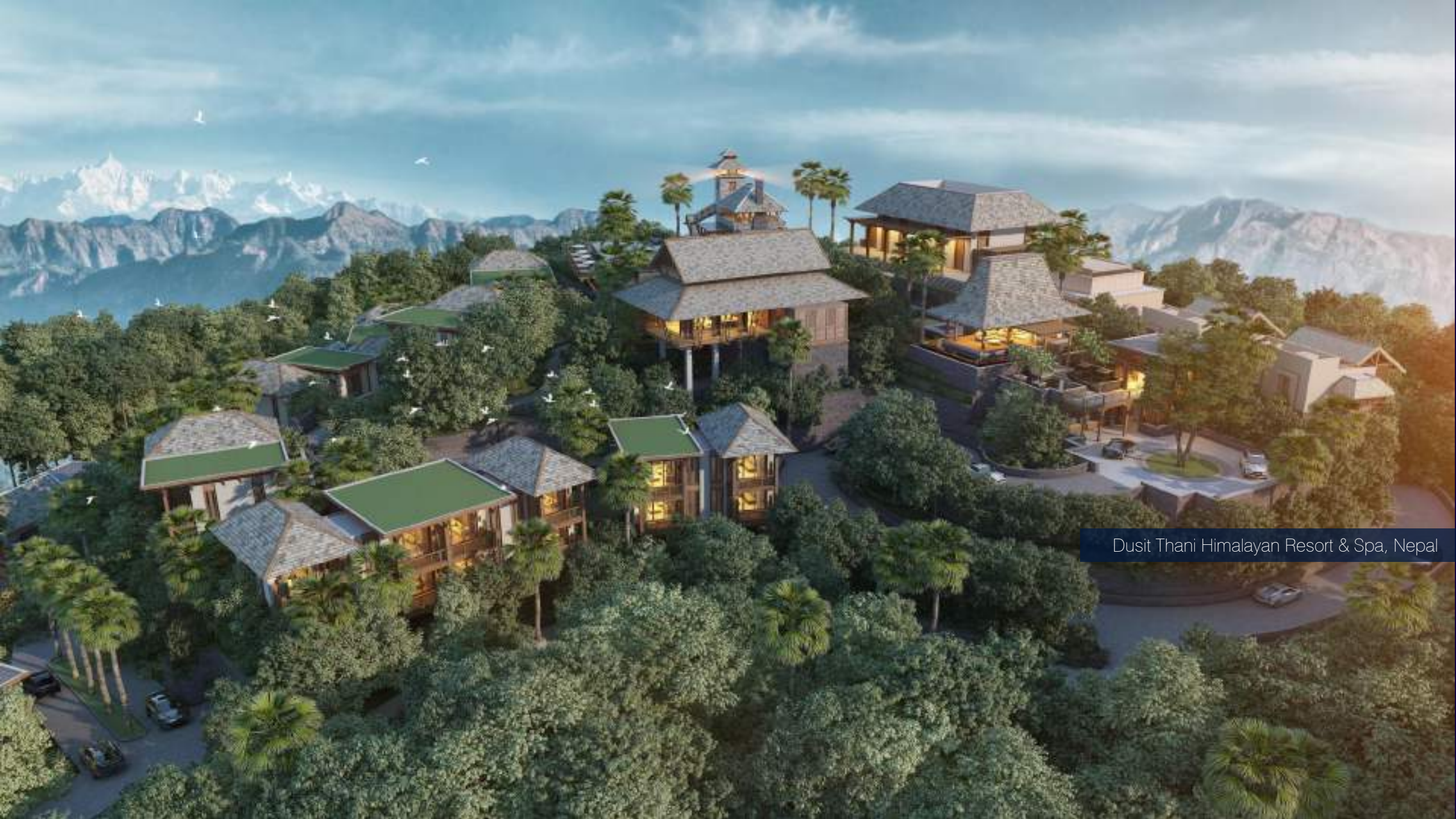
Dusit Thani Himalayan Resort & Spa, Nepal