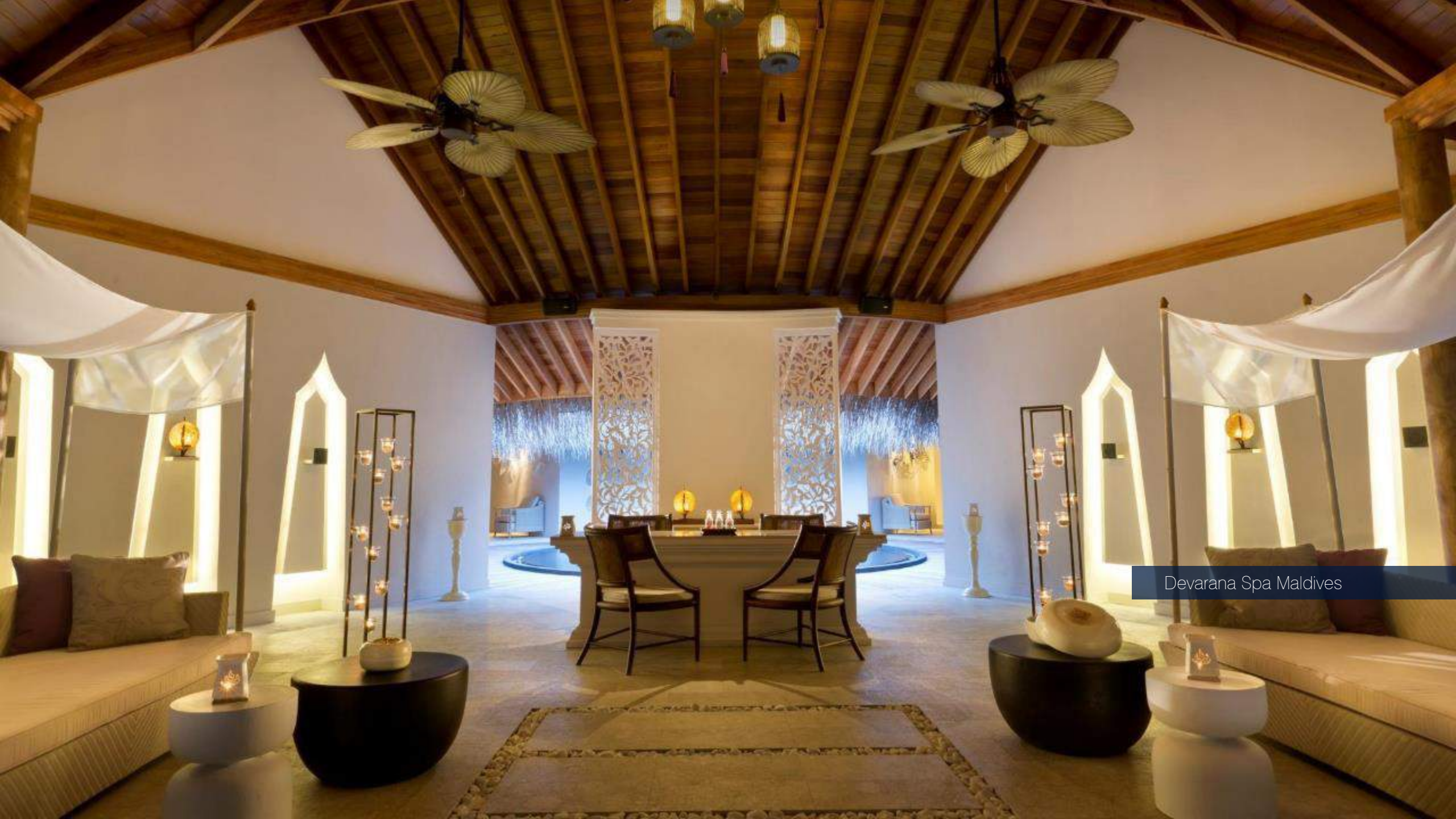
Devarana Spa Maldives