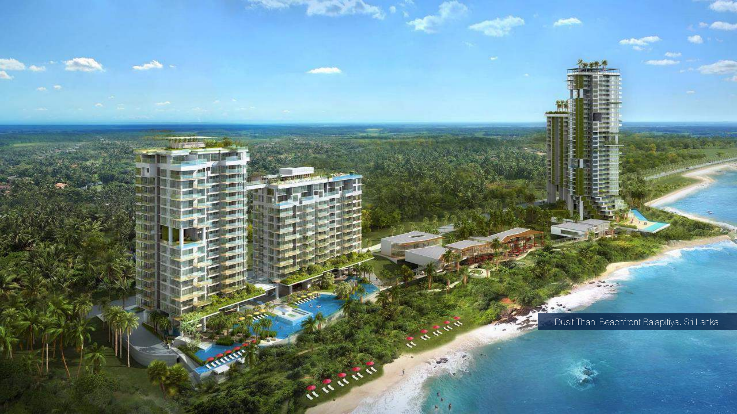
Dusit Thani Beachfront Balapitiya, Sri Lanka