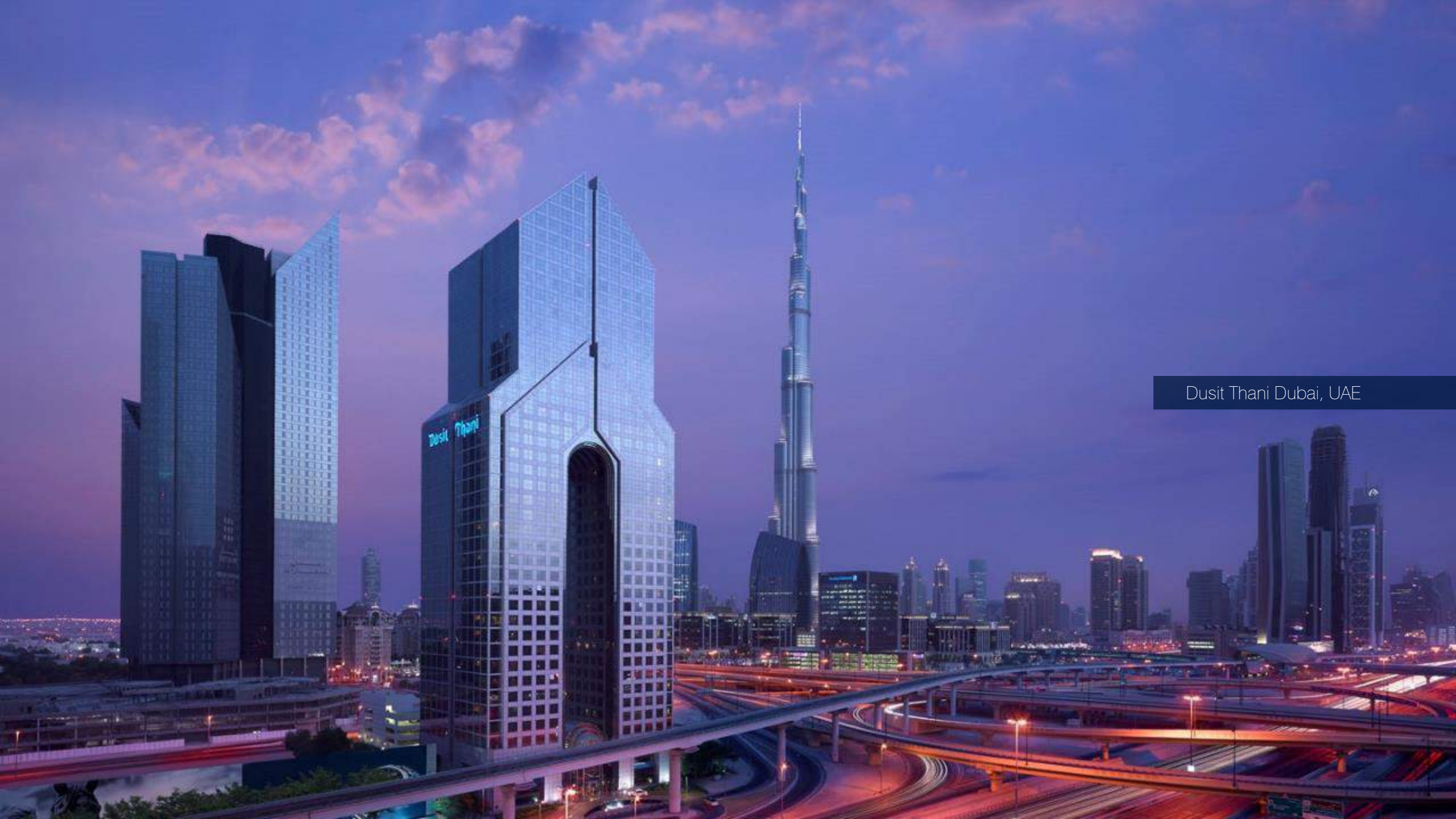
Dusit Thani Dubai, UAE