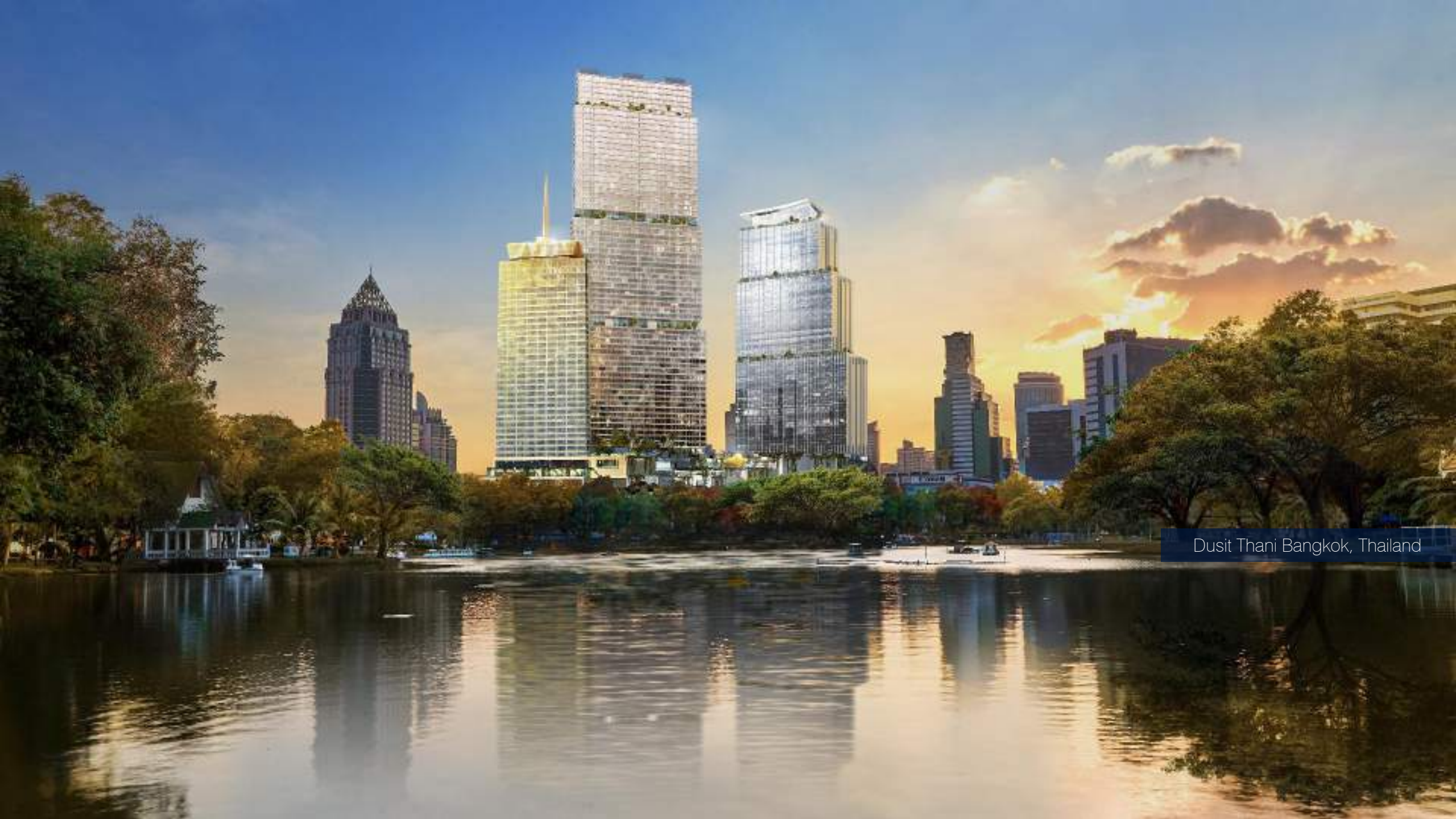
Dusit Thani Bangkok, Thailand