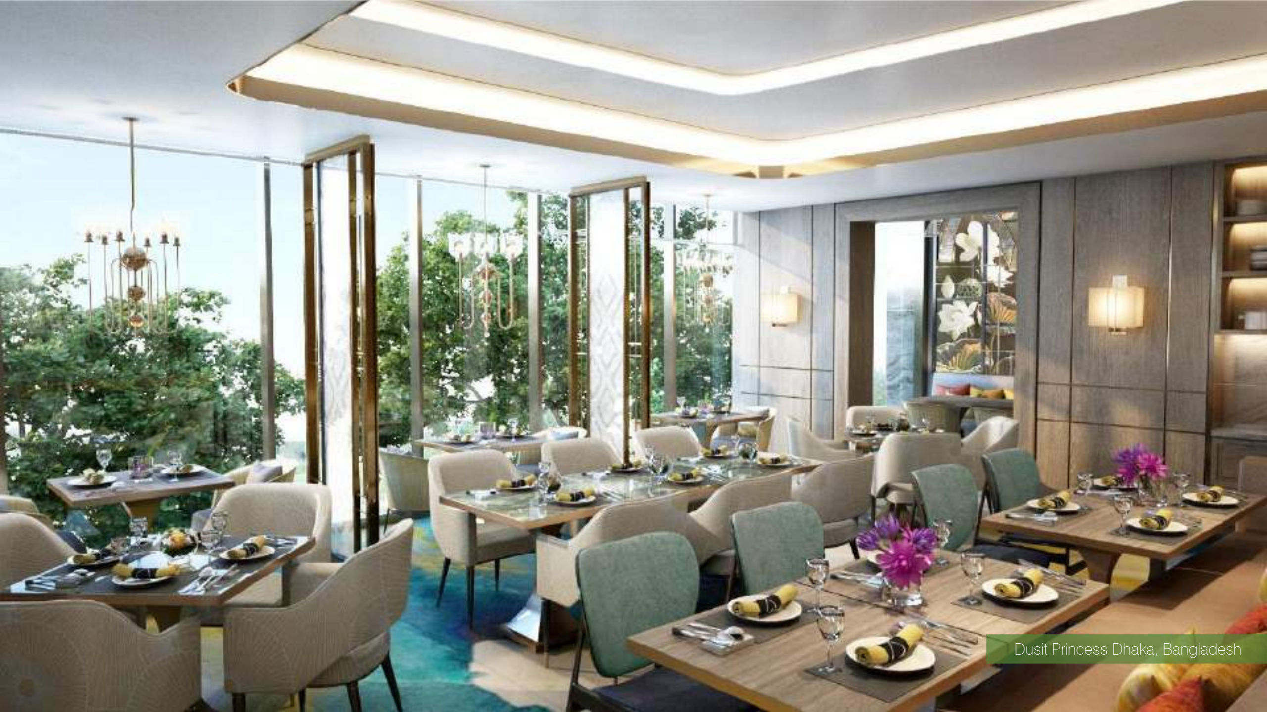
Dusit Princess Dhaka, Bangladesh