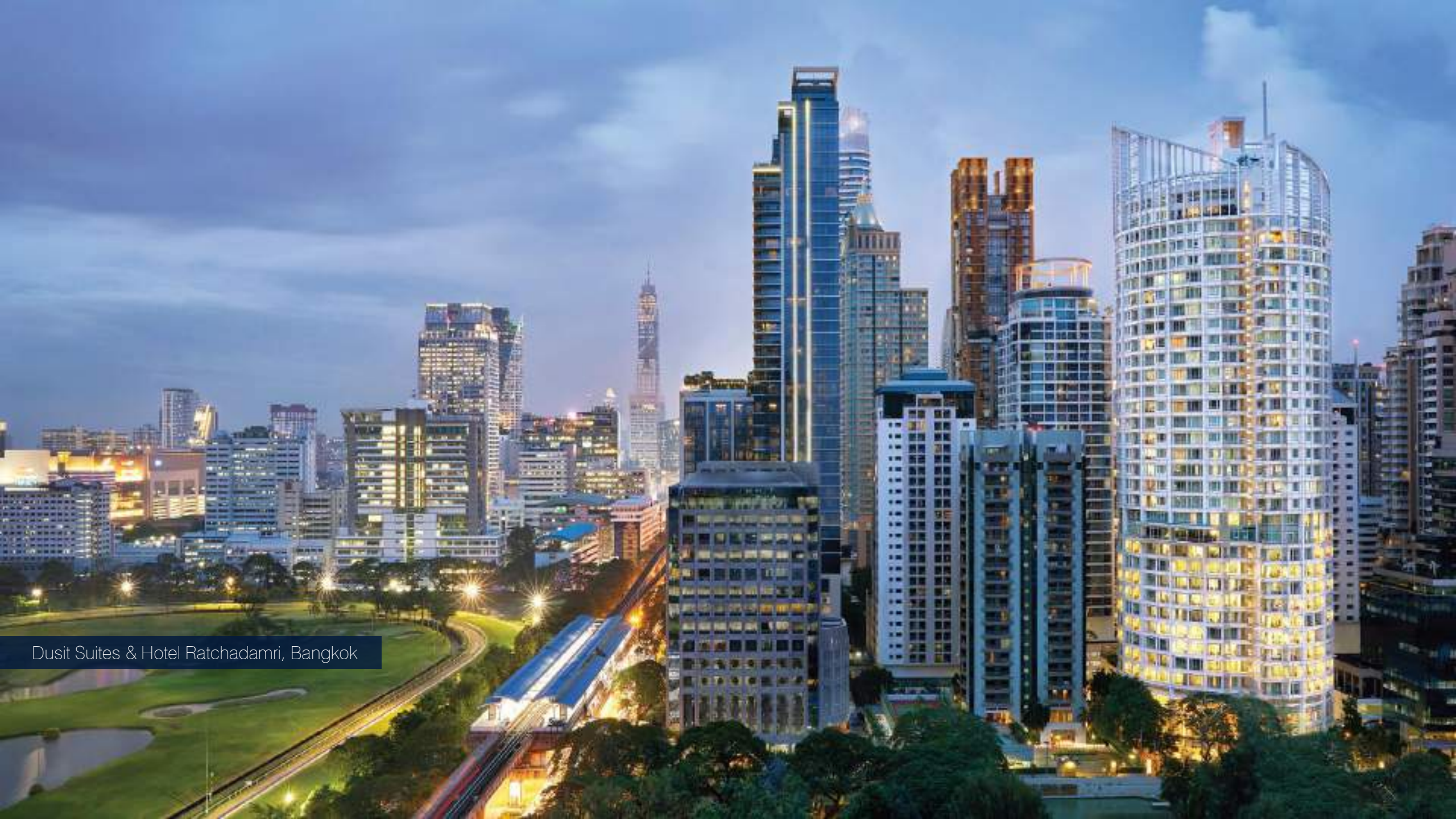
Dusit Suites & Hotel Ratchadamri, Bangkok