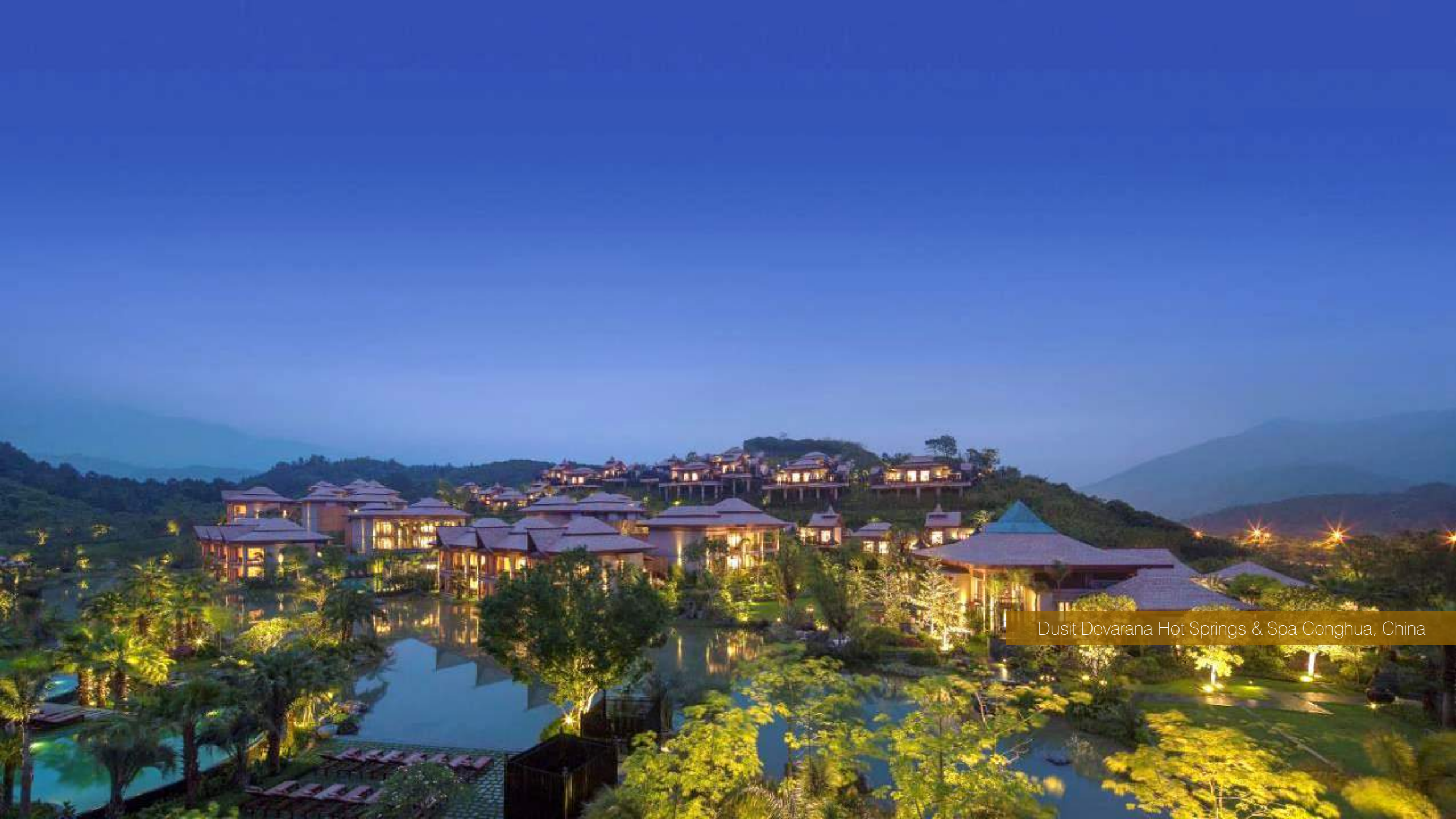
Dusit Devarana Hot Springs & Spa Conghua, China