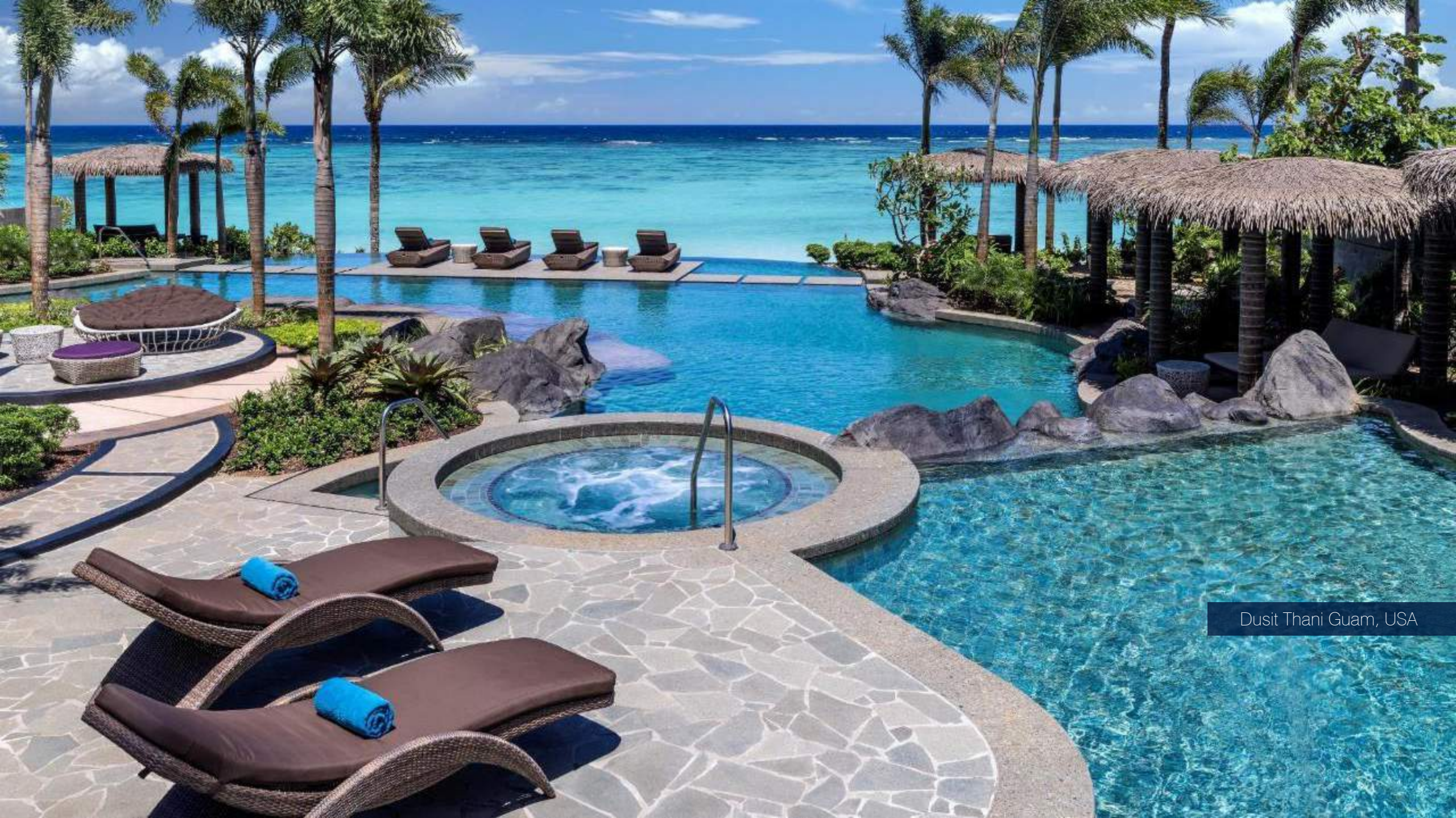
Dusit Thani Guam, USA