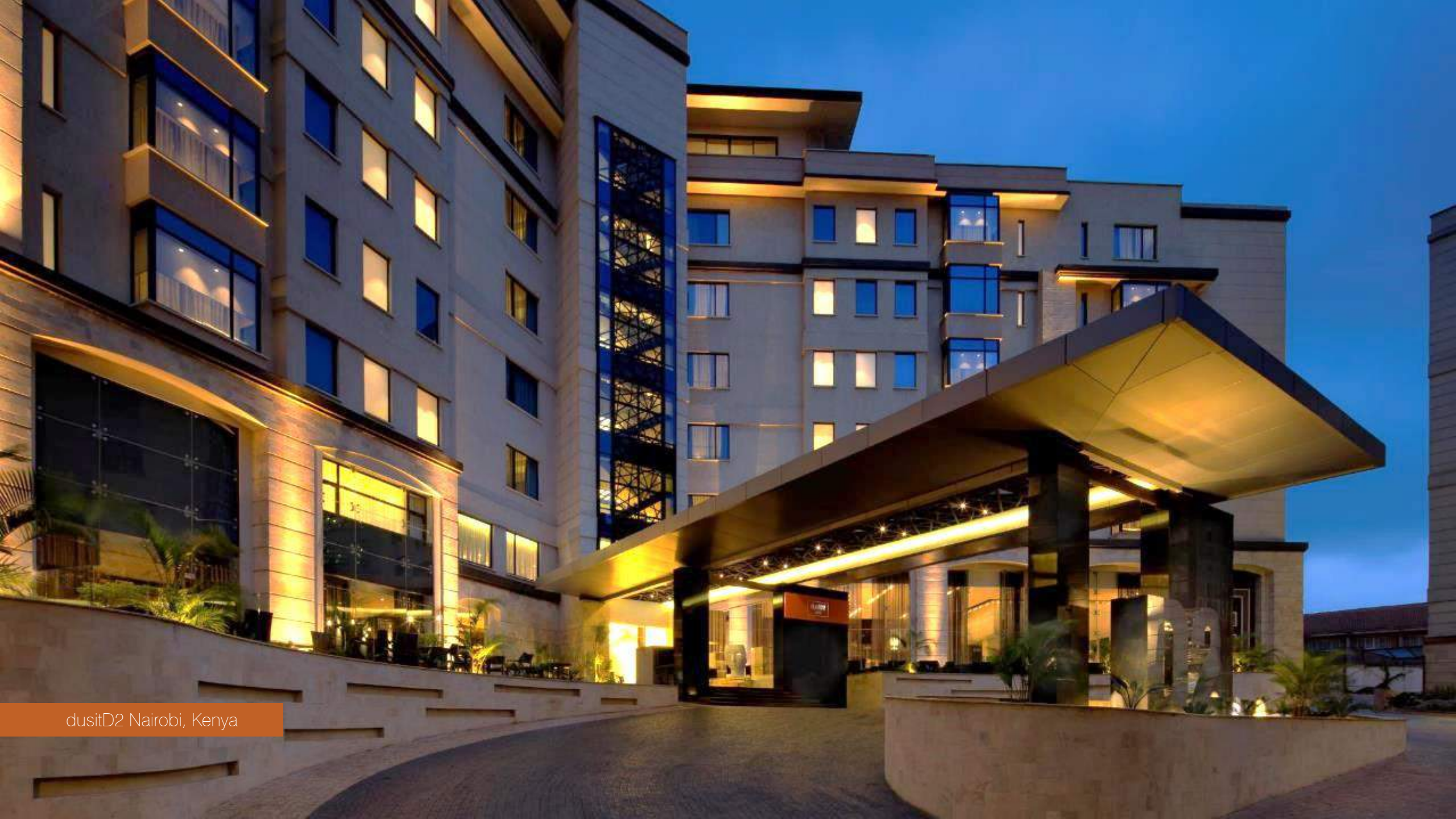
dusitD2 Nairobi, Kenya