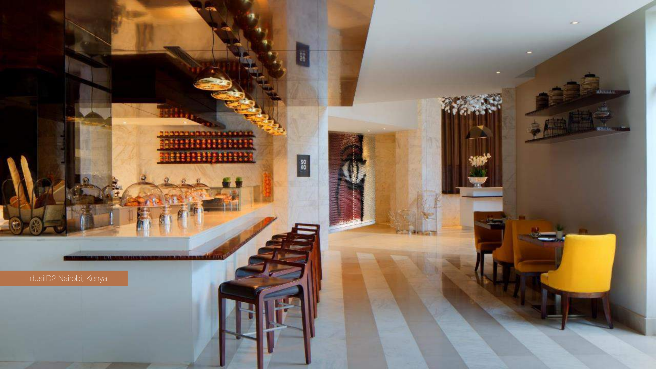
dusitD2 Nairobi, Kenya