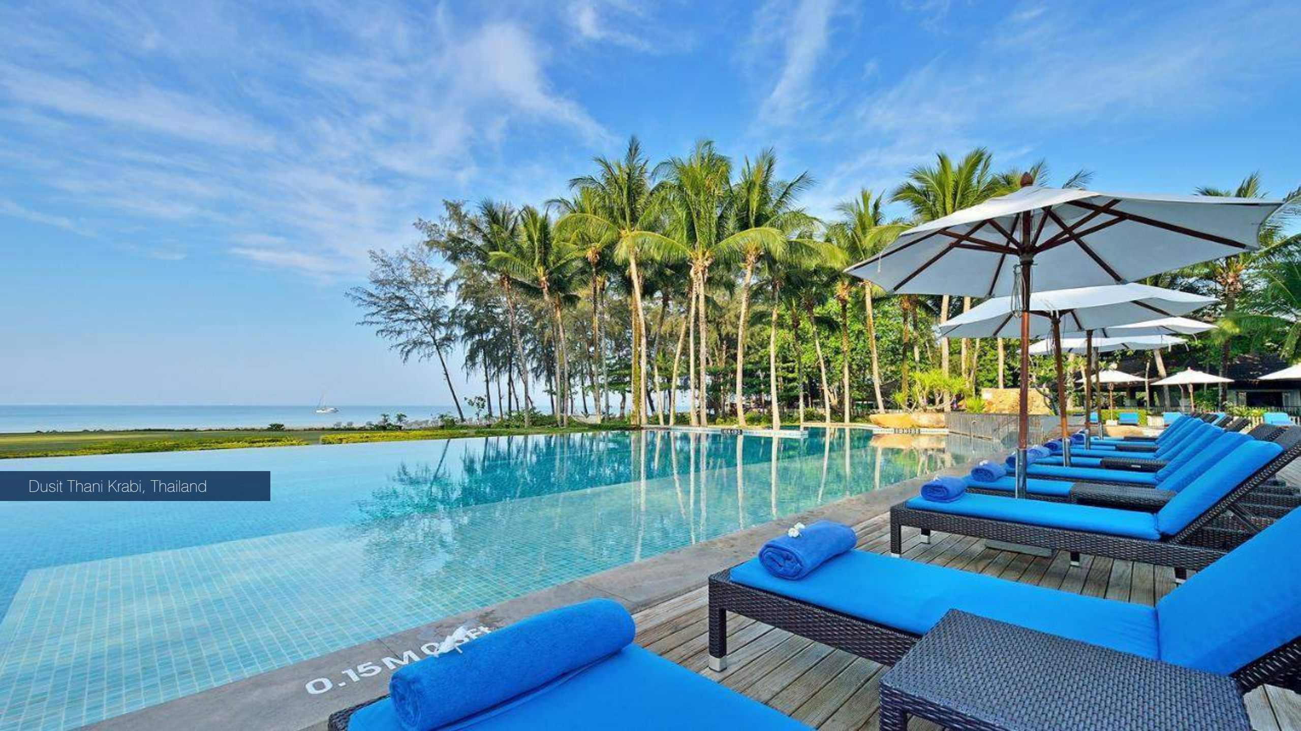
Dusit Thani Krabi, Thailand