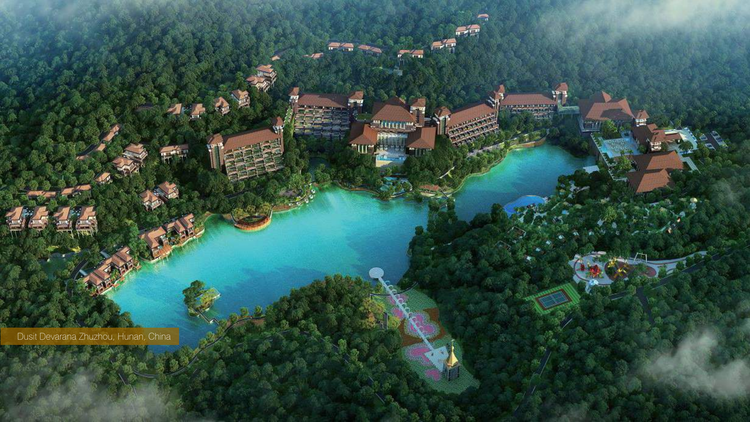
Dusit Devarana Zhuzhou, Hunan, China