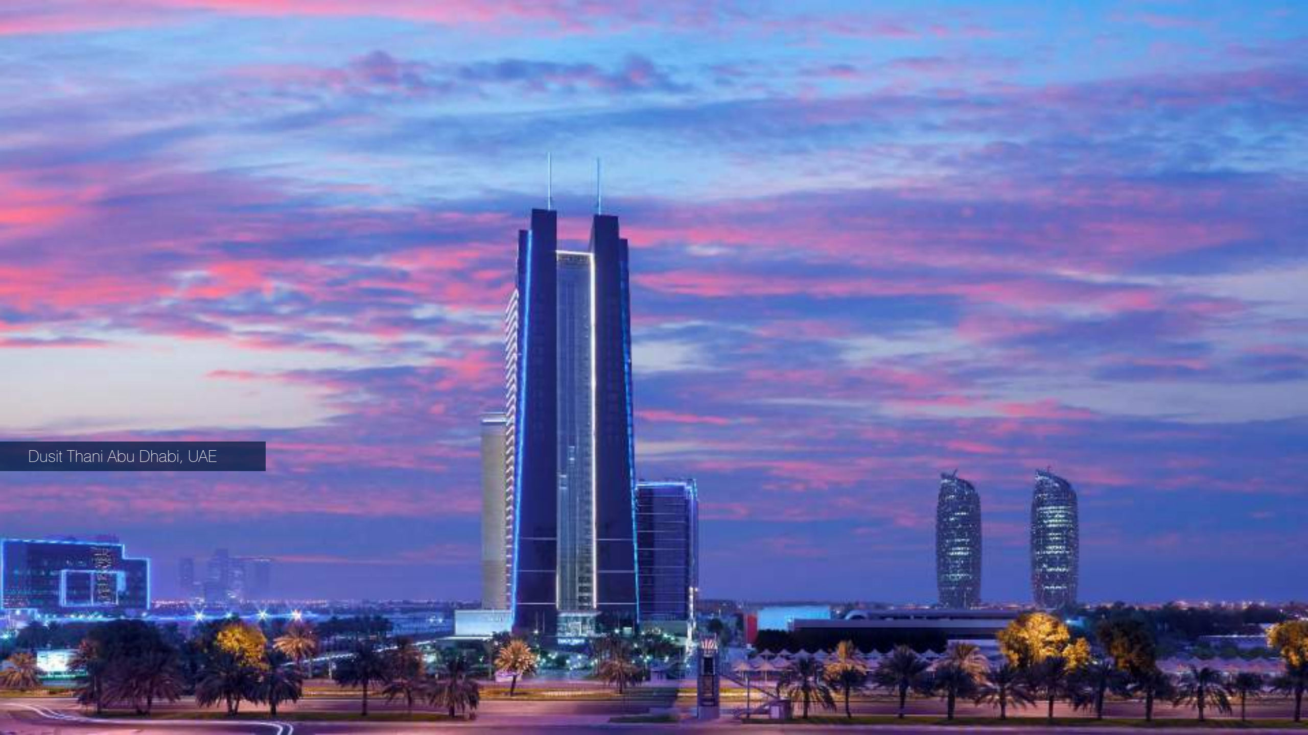
Dusit Thani Abu Dhabi, UAE