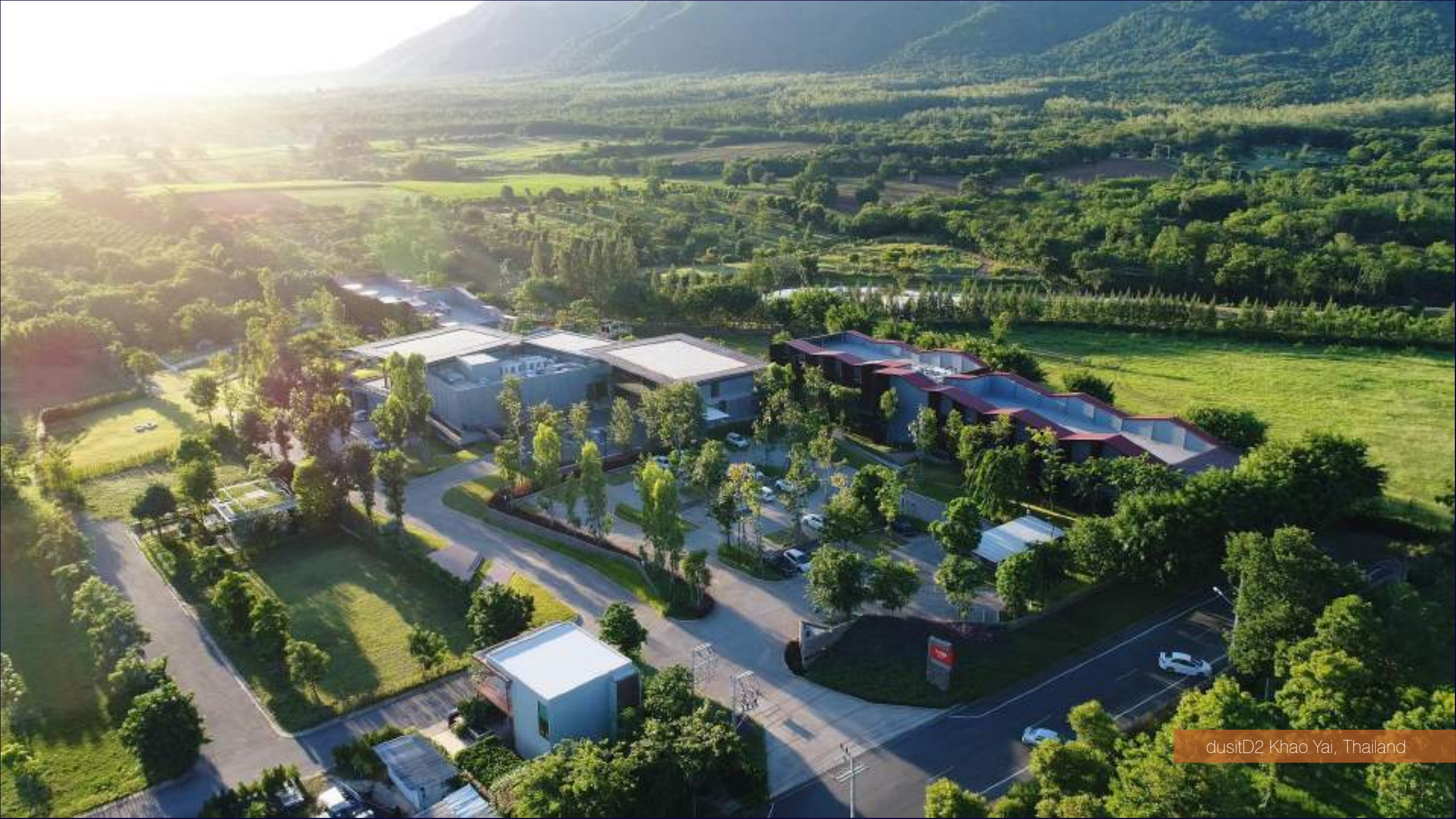
dusitD2 Khao Yai, Thailand