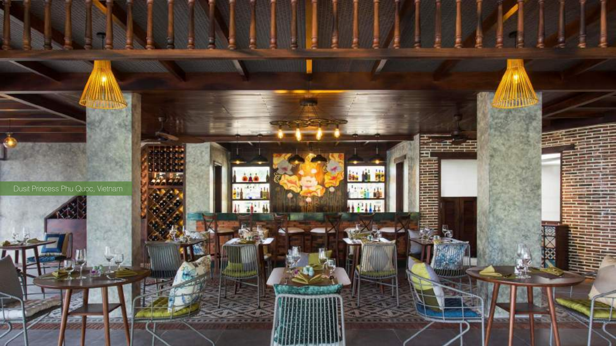
Dusit Princess Phu Quoc, Vietnam